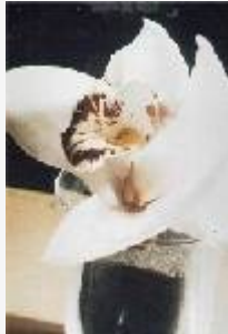
• Allah's Name on a Lule Flower.jpg