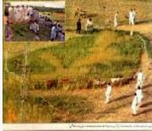
MIRACLE WHEAT CROP.jpg