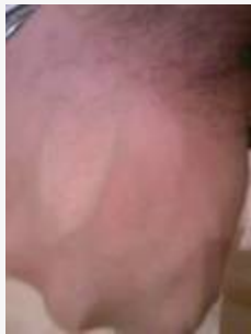
• ALLAH'S NAME IN VEINS.jpg