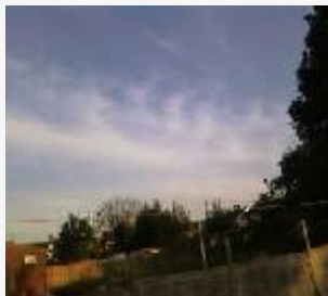
• ALLAH'S NAME IN CLOUDS.jpg