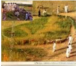
MIRACLE WHEAT CROP.jpg